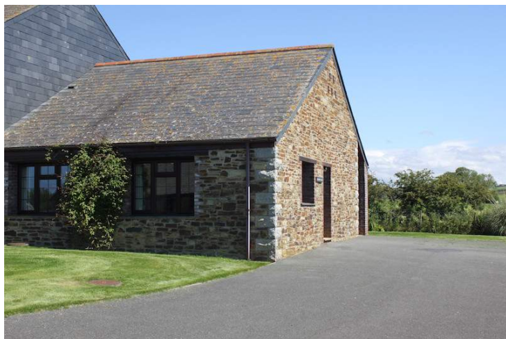
Meadow view entrance

These cottages are bungalows and are all 2 bedrooms. Clover and Primrose have small 3" thresholds to enter the cottage after a tarmac path. Meadow View and Honeysuckle have one 15cm step to enter the the cottage. Kitchen and lounge areas are open plan and level. The main doors are 73cm wide and the internal doors are 70cm wide.